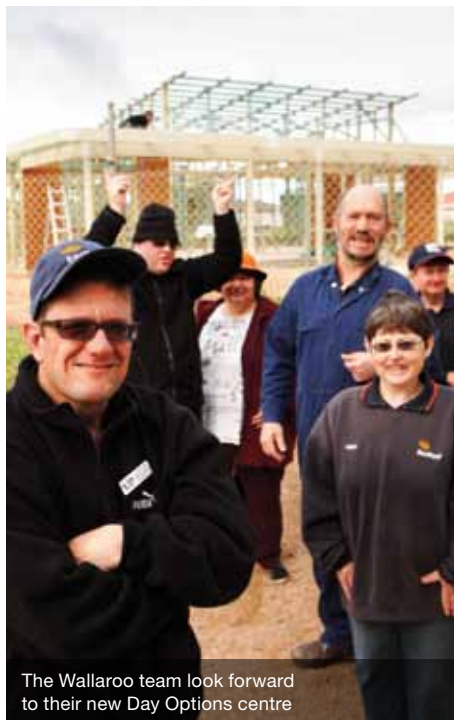
The Wallaroo team look forward to their new Day Options centre