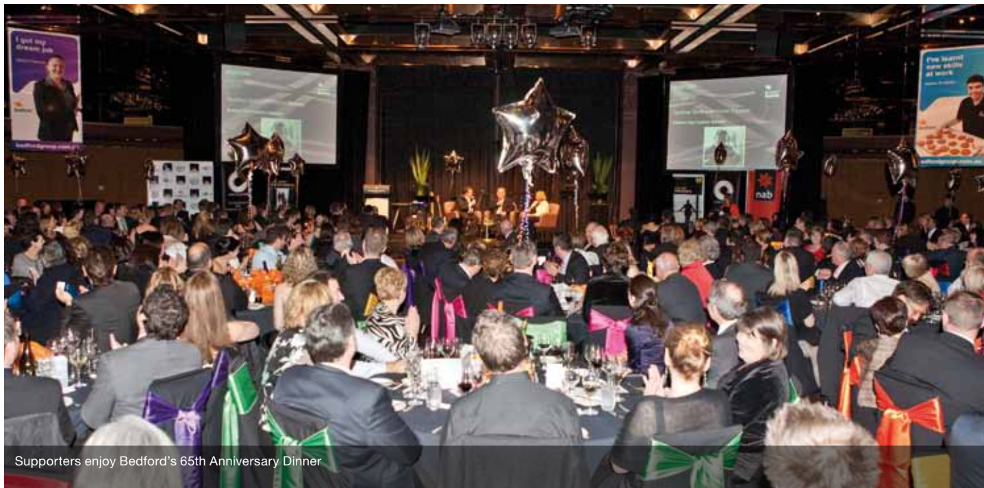
Supporters enjoy Bedford's 65th Anniversary Dinner