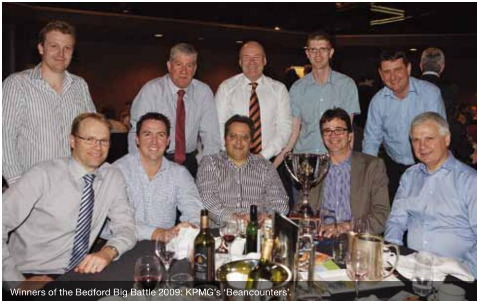
Winners of the Bedford Big Battle 2009: KPMG's 'Beancounters'.