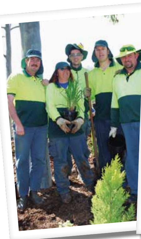
Delfin staff get their hands dirty landscaping Bedford's residential facilities.