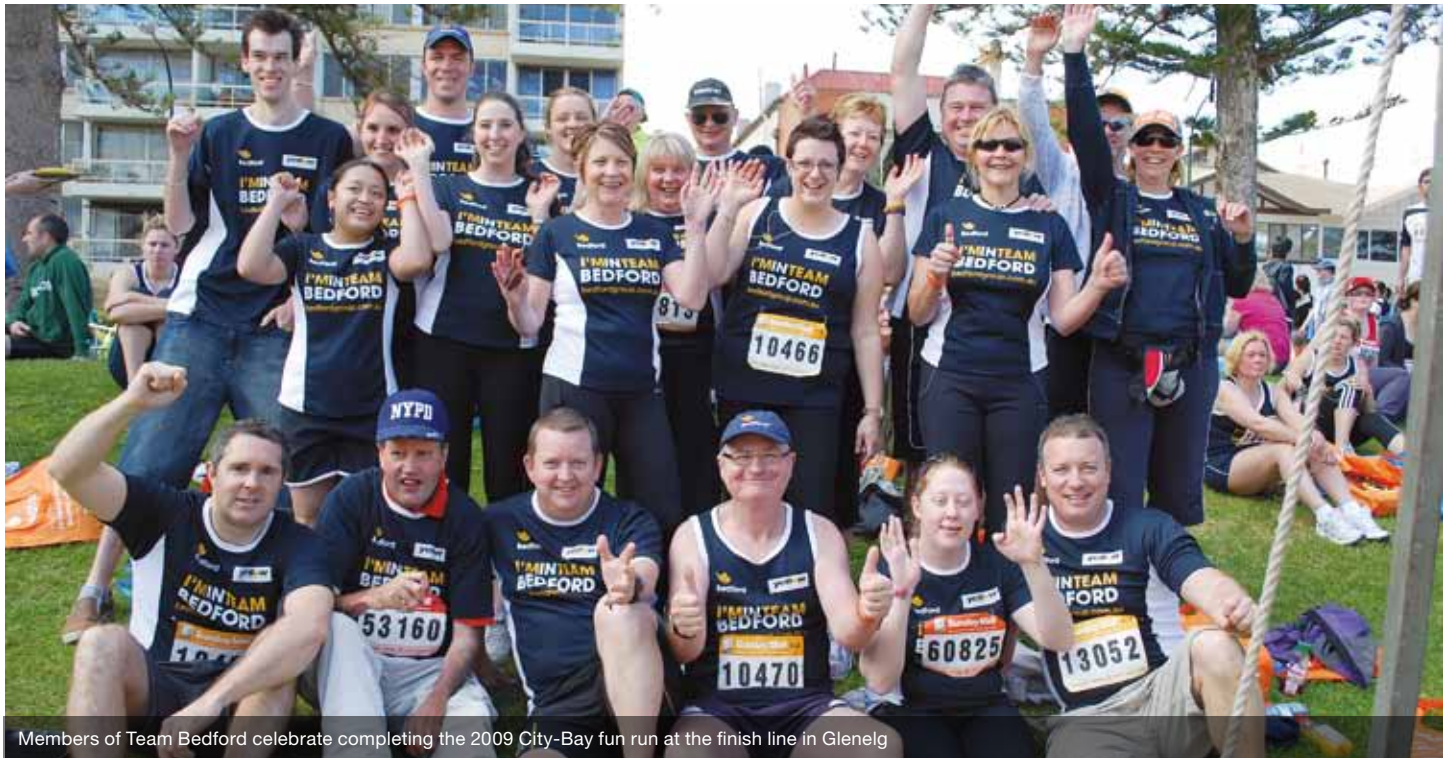
Members of Team Bedford celebrate completing the 2009 City-Bay fun run at the finish line in Glenelg